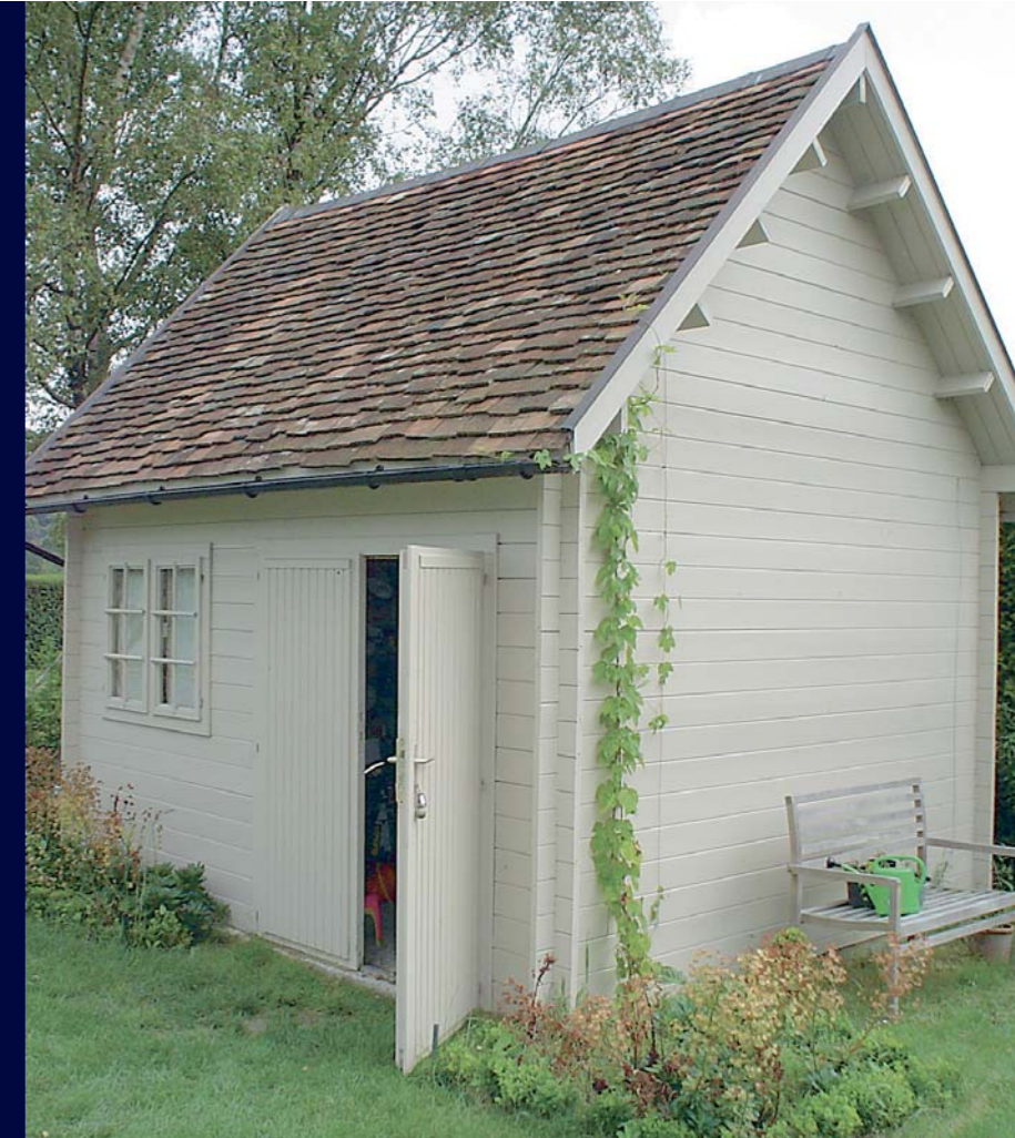
Mr Hodge chose a Cottage 4.5m x 3.0m in 45mm logs