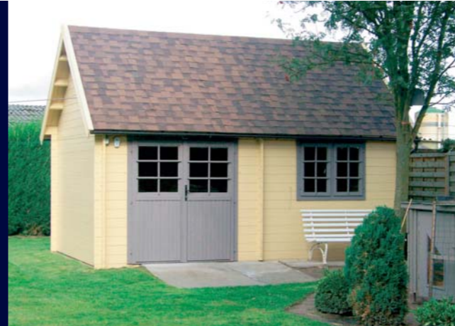
Mr Johnston chose a Cottage 4.85m x 2.45m in 45mm logs

The Interlock Cottage features a steep 42 degree roof and eaves side doors. These super looking garden buildings are perfect for all kinds of uses from garden sheds, studios and workshops to cosy hideaways. They also make a great home office in your garden. Many options are available including double glazing, loft floors & insulation.