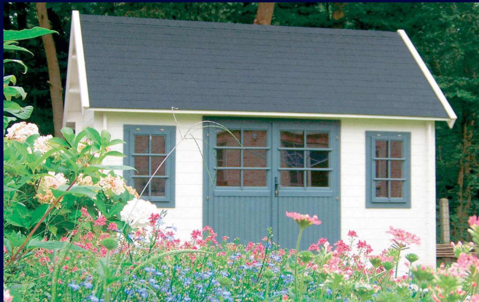
Mrs Adams chose a Cottage 3.95m x 3.0m in 45mm logs