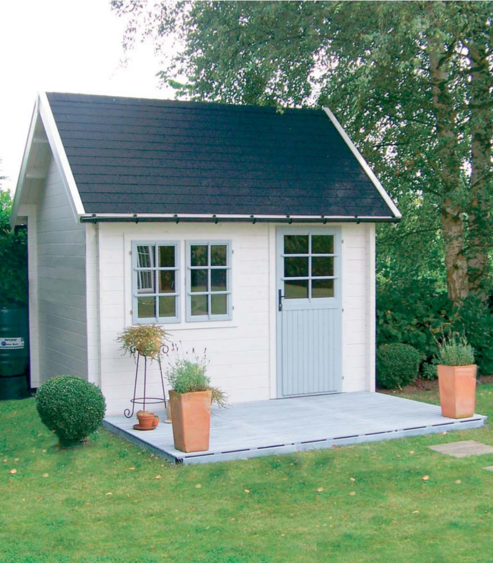
Miss Haddon's Cottage garden office is 3.0m x 2.45m in 33mm logs