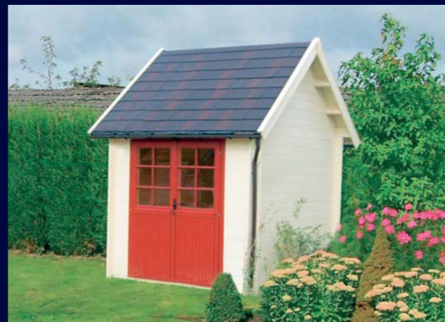
Mr Edwards chose a Cottage 2.45m x 2.0m in 28mm logs