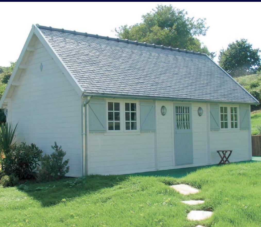
Miss July chose a Cottage for guest accommodation 7.0m x 3.0m in 56mm logs